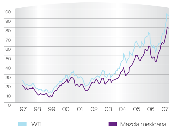
Precio promedio de petróleo crudo exportado dólares por barril