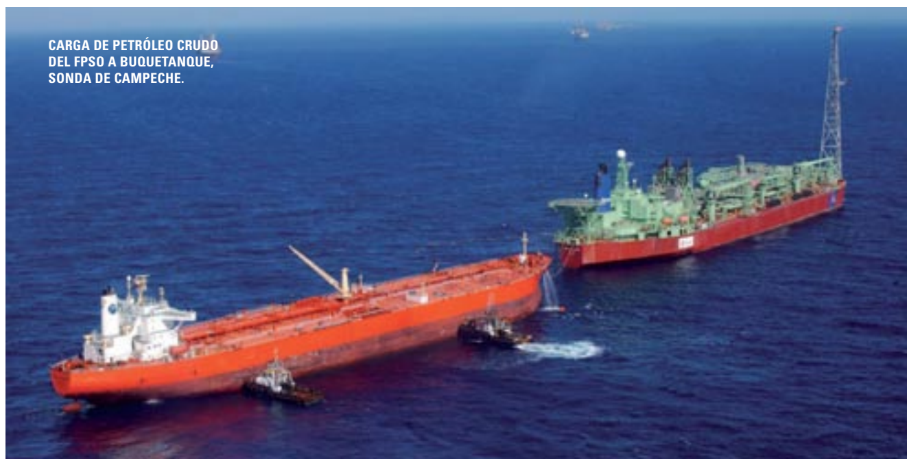
CARGA DE PETRÓLEO CRUDO DEL FPSO A BUQUETANQUE, SONDA DE CAMPECHE.