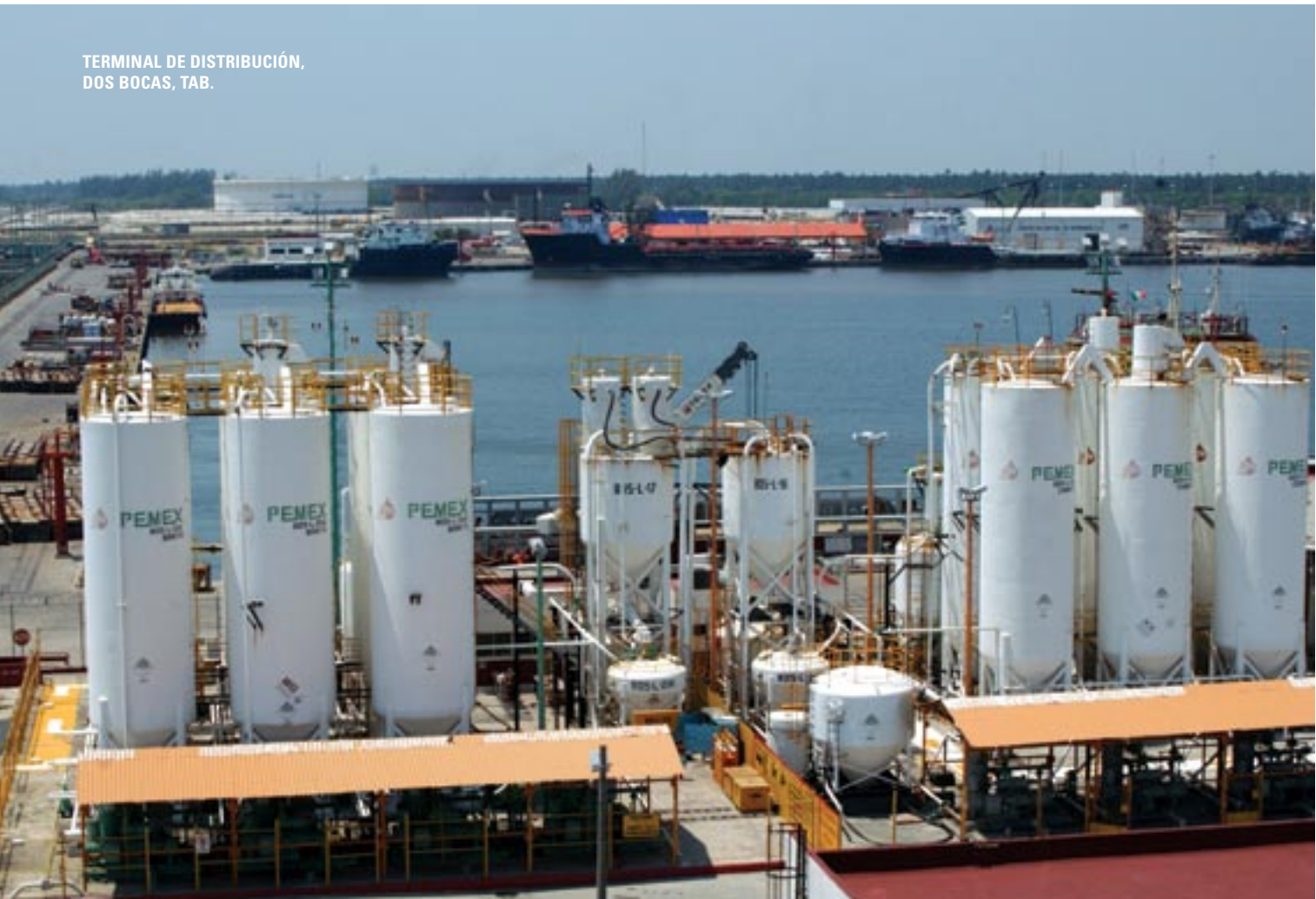
TERMINAL DE DISTRIBUCIÓN, DOS BOCAS, TAB.